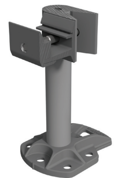
Flush Mount Assembly