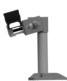
Tilt Mount Assembly