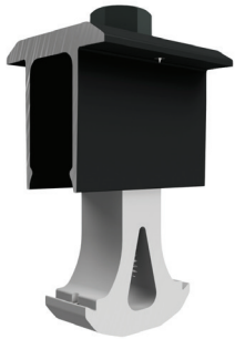
Ultra Rail Mid Clamp

SnapRack has introduced the new Ultra Rail Mid Clamps and Ultra Rail End Clamps to improve the installation experience and SKU efficiency for installers. The one-size-fits-all universal clamping height of the module clamps are compatible with 30mm to 46mm module frame sizes, reducing the number of SKUs per module height. The new Mid Clamps can provide greater spans by reducing the effect of the wind load uplift from the \frac{3}{4} " gap created between modules. Installers will find there is more space in the rail channel for wire management from eliminating the bolt inference.