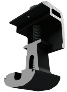
Ultra Rail End Clamp